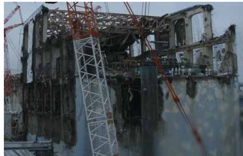
Removal works of the girder of overhead traveling crane (5) March 5, 2012