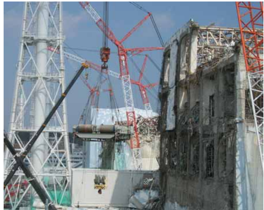
Removal works of the trolley of overhead traveling crane (2)