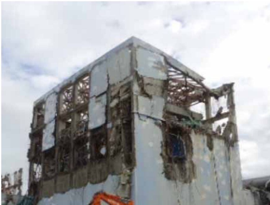
Removal works of debris on the upper part of the Reactor Building of Unit 4 (before works)