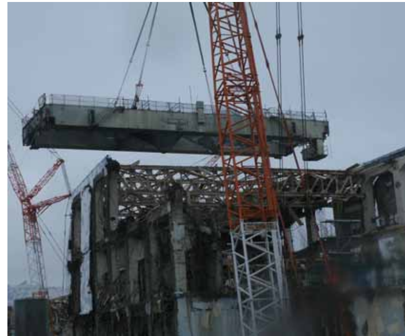
Removal works of the girder of overhead traveling crane (2)