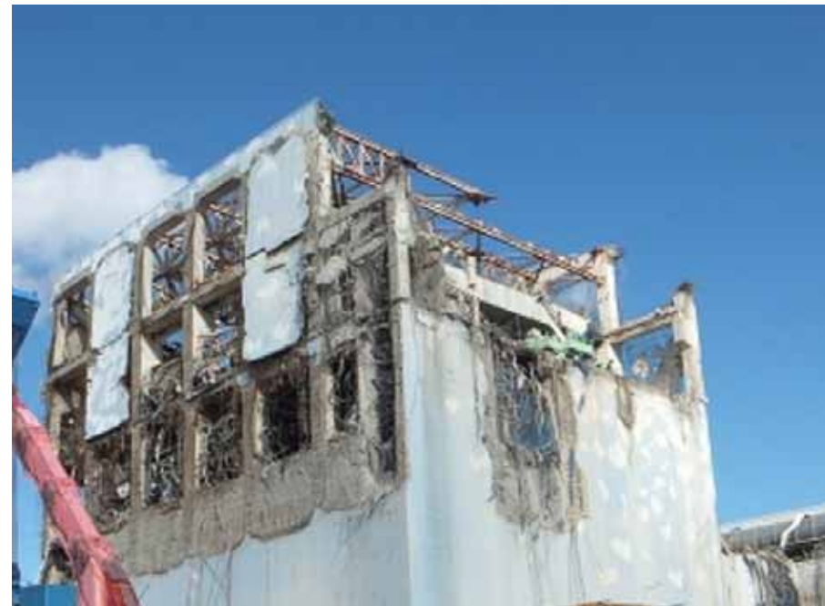
Removal works of debris on the upper part of the Reactor Building of Unit 4