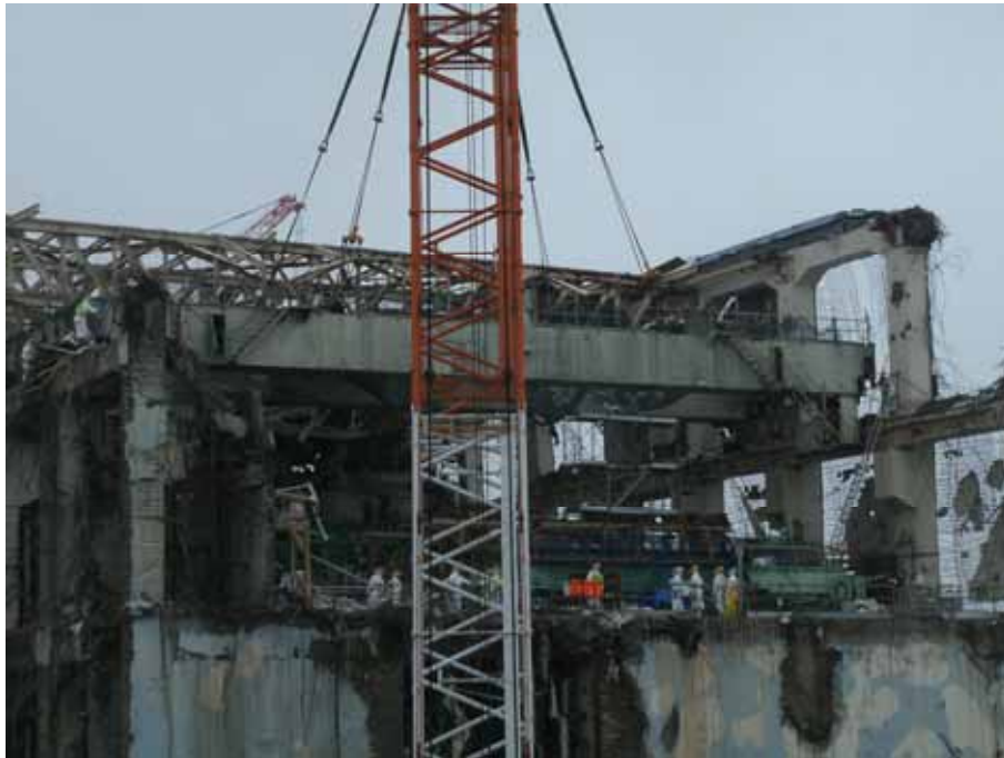
Removal works of the girder of overhead traveling crane (1)