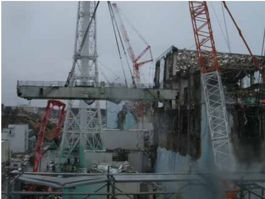
Removal works of the girder of overhead traveling crane (3)