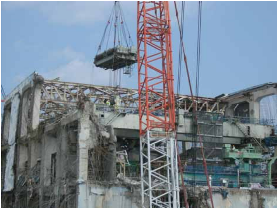
Removal works of the trolley of overhead traveling crane (1)