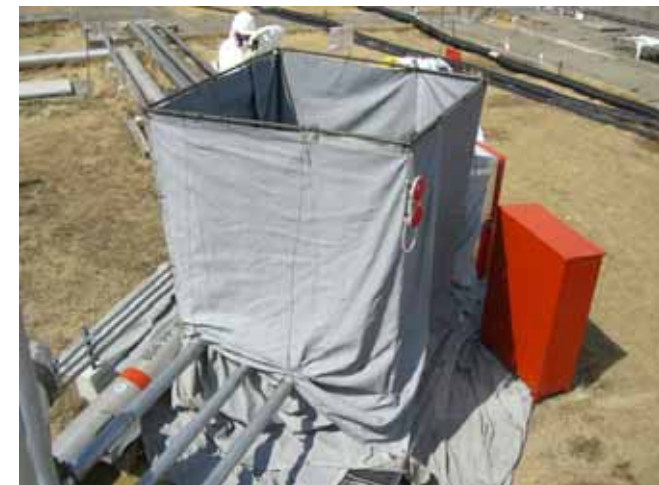
Fire protection after repair