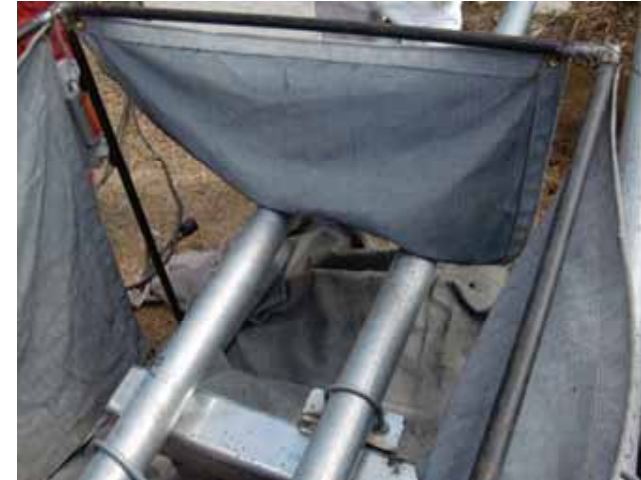
Fire protection causing a fire

*Spatter: A drop or splash of spattered metal.