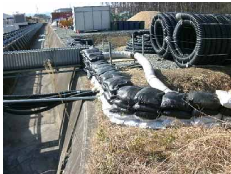
<Sandbags placed around the drainage>