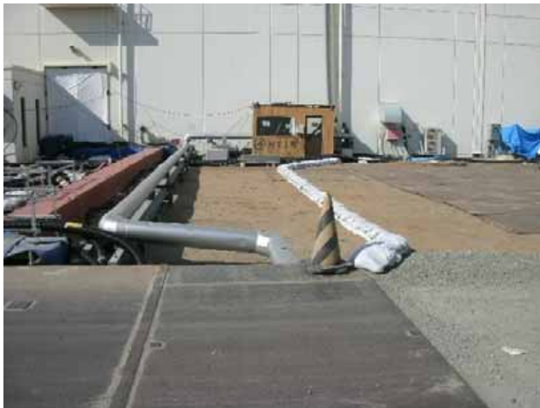
<Sandbags placed on the piping which crosses the road>