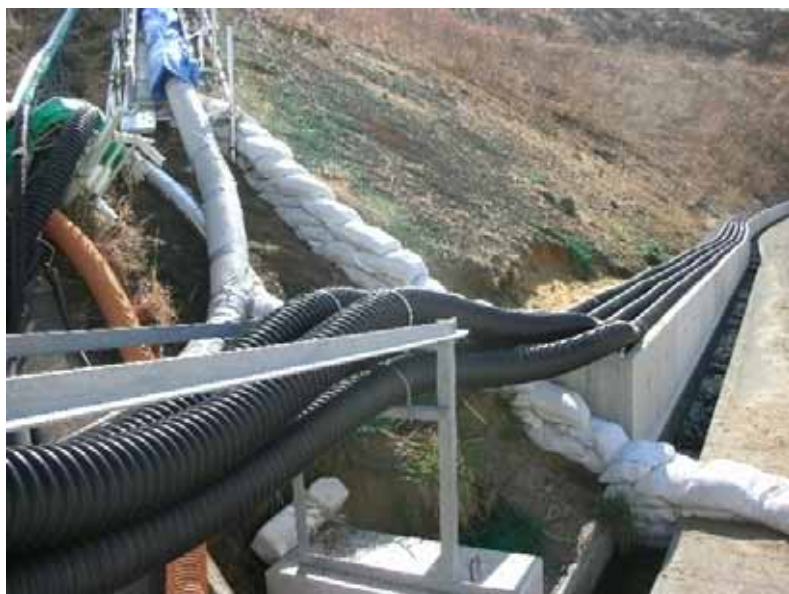
<Sandbags placed on the slope>