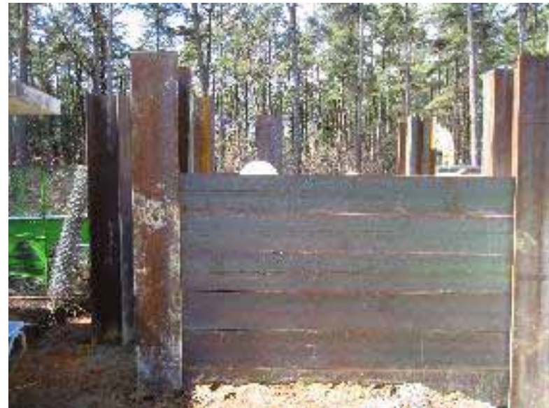
< Settlement of shelter wall >

Date : support pillar March 17, 2012 shelter wall March 19, 2012