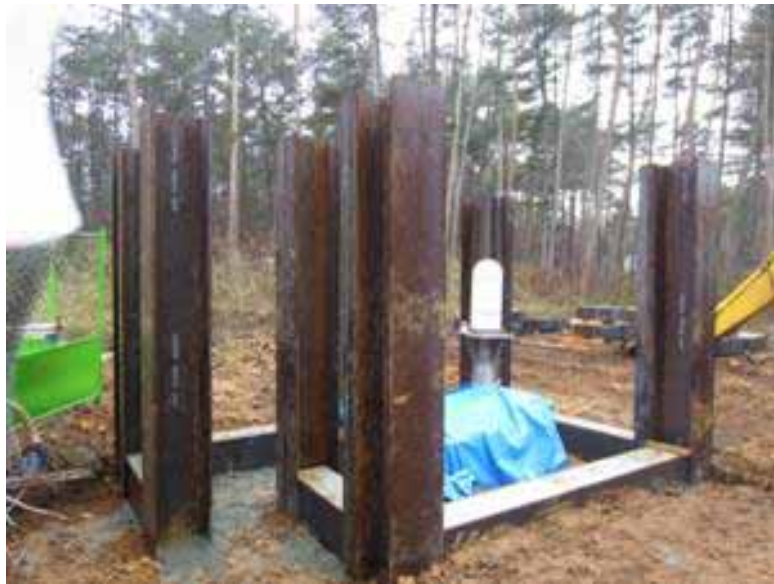
< Settlement of support pillar >