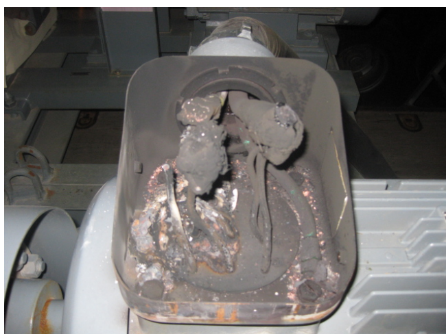
Upper part of the motor terminal