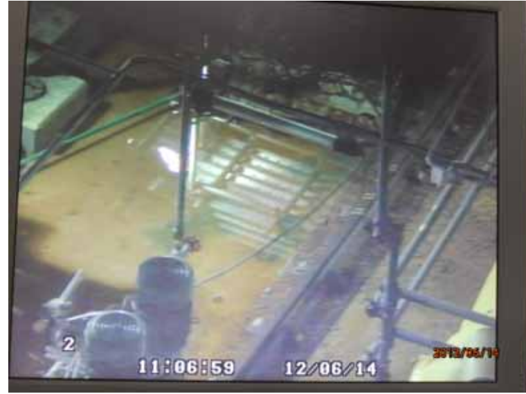
Monitoring camera image (Enlarged)