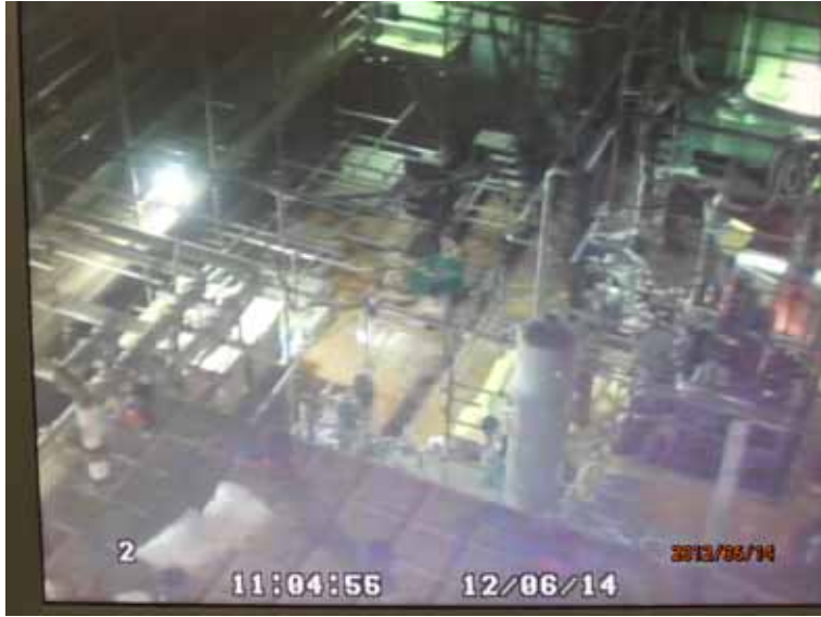
Monitoring camera image