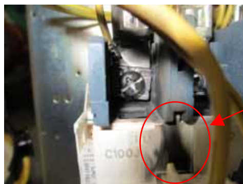
Black soot found