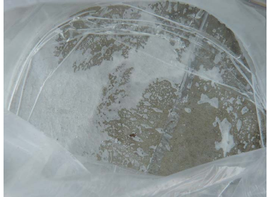
View from the above

Photos taken on September 10, 2012 by TEPCO