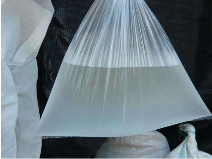
Buffer tank water