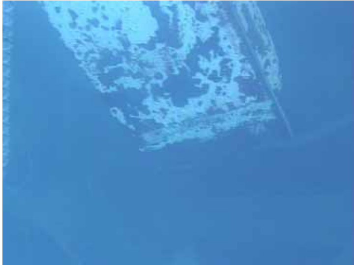
Debris in the spent fuel pool (under water)