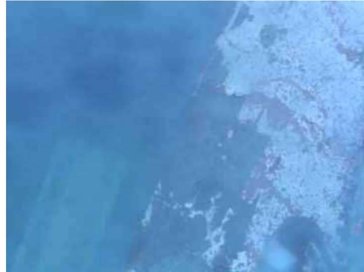
Debris in the spent fuel pool (under water)