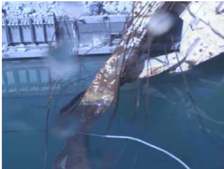
Debris in the spent fuel pool (water surface)