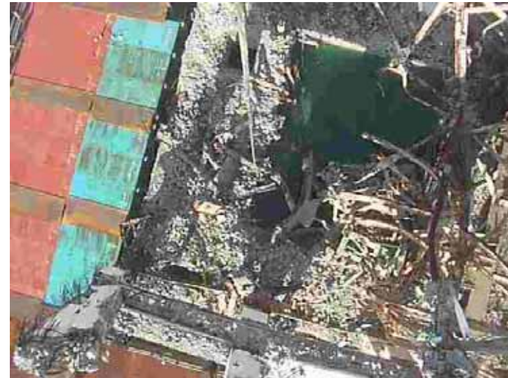
The entire view of the spent fuel pool