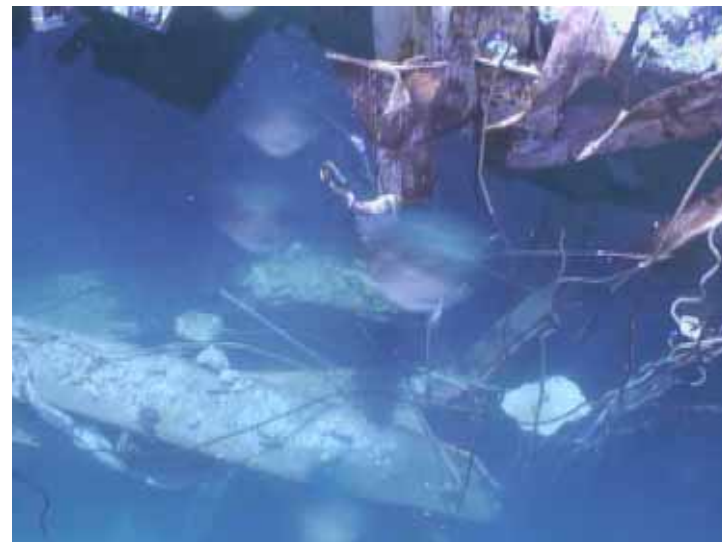
Debris in the spent fuel pool (water surface)