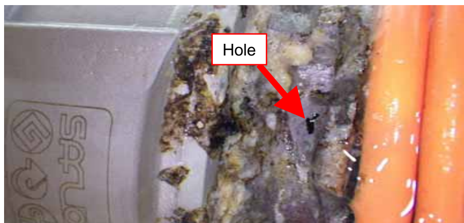
Location of water leakage (Enlarged image)