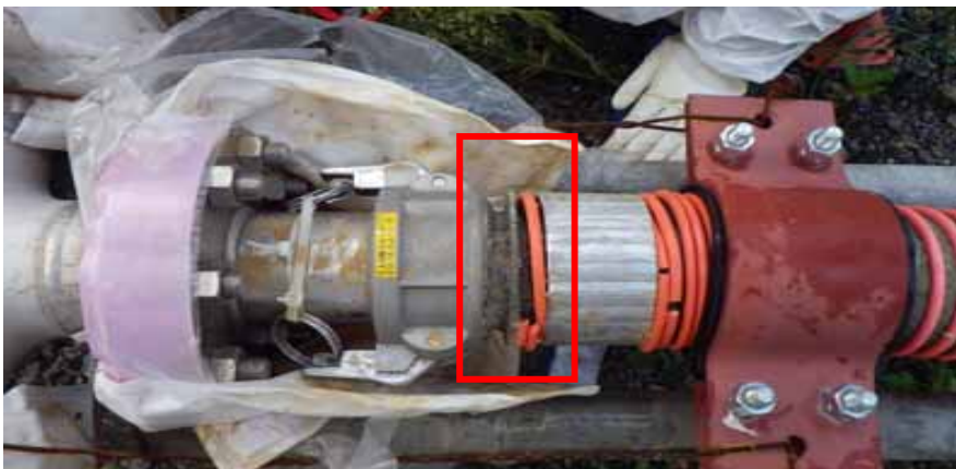
Location of water leakage