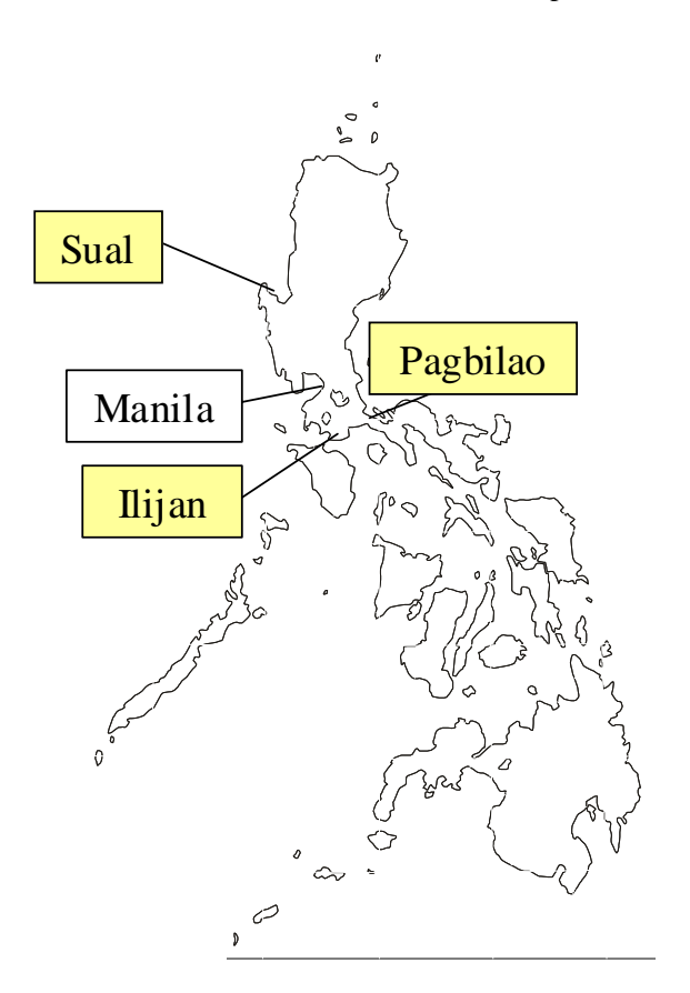
Location of Power Plants