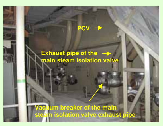
4. Inside of PCV: Near the control rod drive hydraulic system pipes (Photo taken on April 11, 2012)