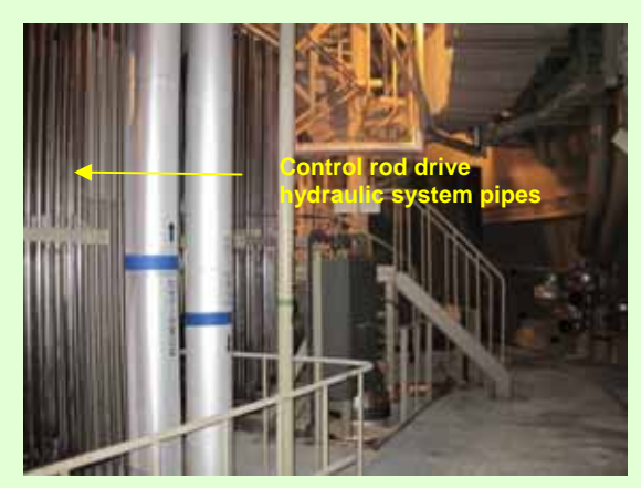
3. Inside of PCV: Near the control rod drive hydraulic system pipes (Photo taken on April 11, 2012)

Visual inspection was completed on May 29, 2012. As a result, we found no leakage of reactor coolant or deformation/damage of equipments and piping inside PCV and that there are no factors hindering the cold shutdown function.