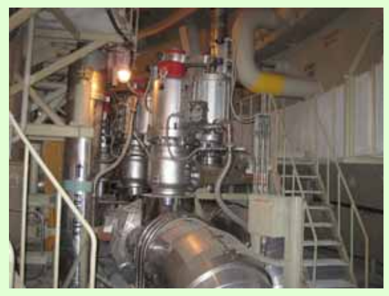
2. Inside PCV (Main steam isolation valve) (Photo taken on April 17, 2012)