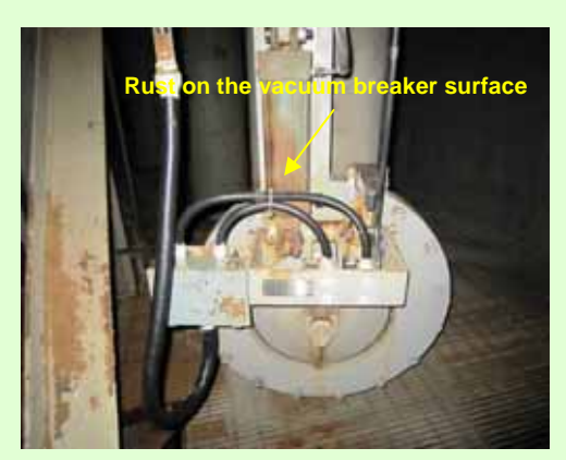
9. Rust on the vacuum breaker surface (Photo taken on April 17, 2012)

Due to the temporary temperature/humidity increase after the plant shutdown, minor issues were found such as the paint inside PCV partially coming off and rust on the surface of some equipments. However, these do not have impact on the cold shutdown function.