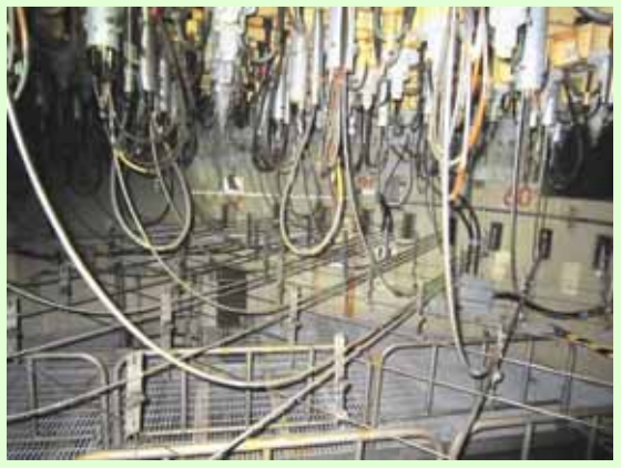
8. Pedestal (Base structure of RPV) (Photo taken on May 10, 2012)