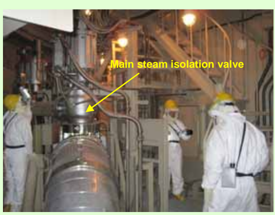
7. Visual inspection (Photo taken on May 10, 2012)