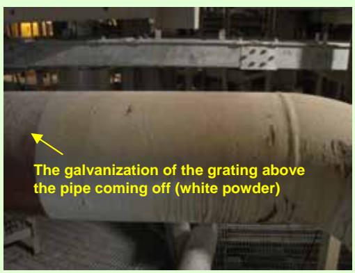
11. Galvanization of the grating coming off (white powder) (Photo taken on April 17, 2012)