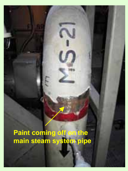
10. Paint coming off on the main steam system pipe (Photo taken on March 13, 2012)