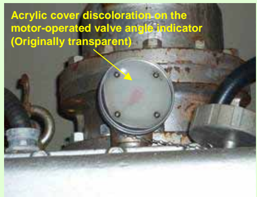
12. Acrylic cover discoloration on the motor-operated valve angle indicator (Photo taken on March 13, 2012)