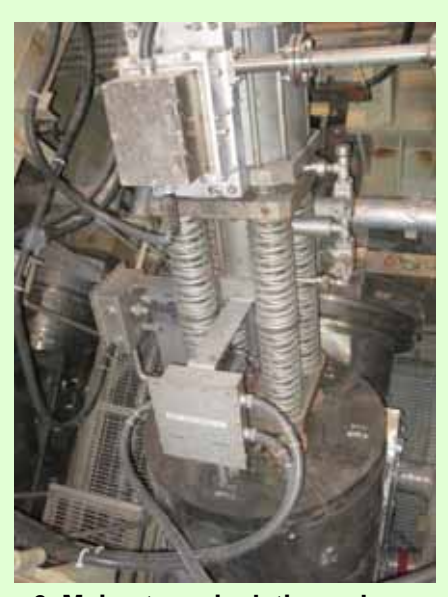
6. Main steam isolation valve (Photo taken on April 11, 2012)