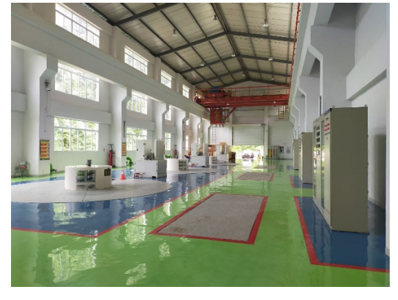
Air Putih